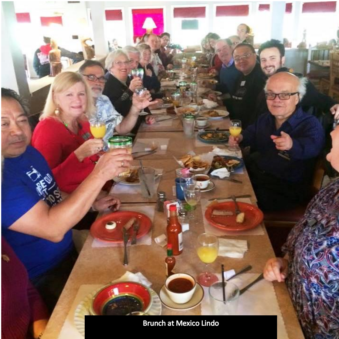
Brunch at Mexico Lindo