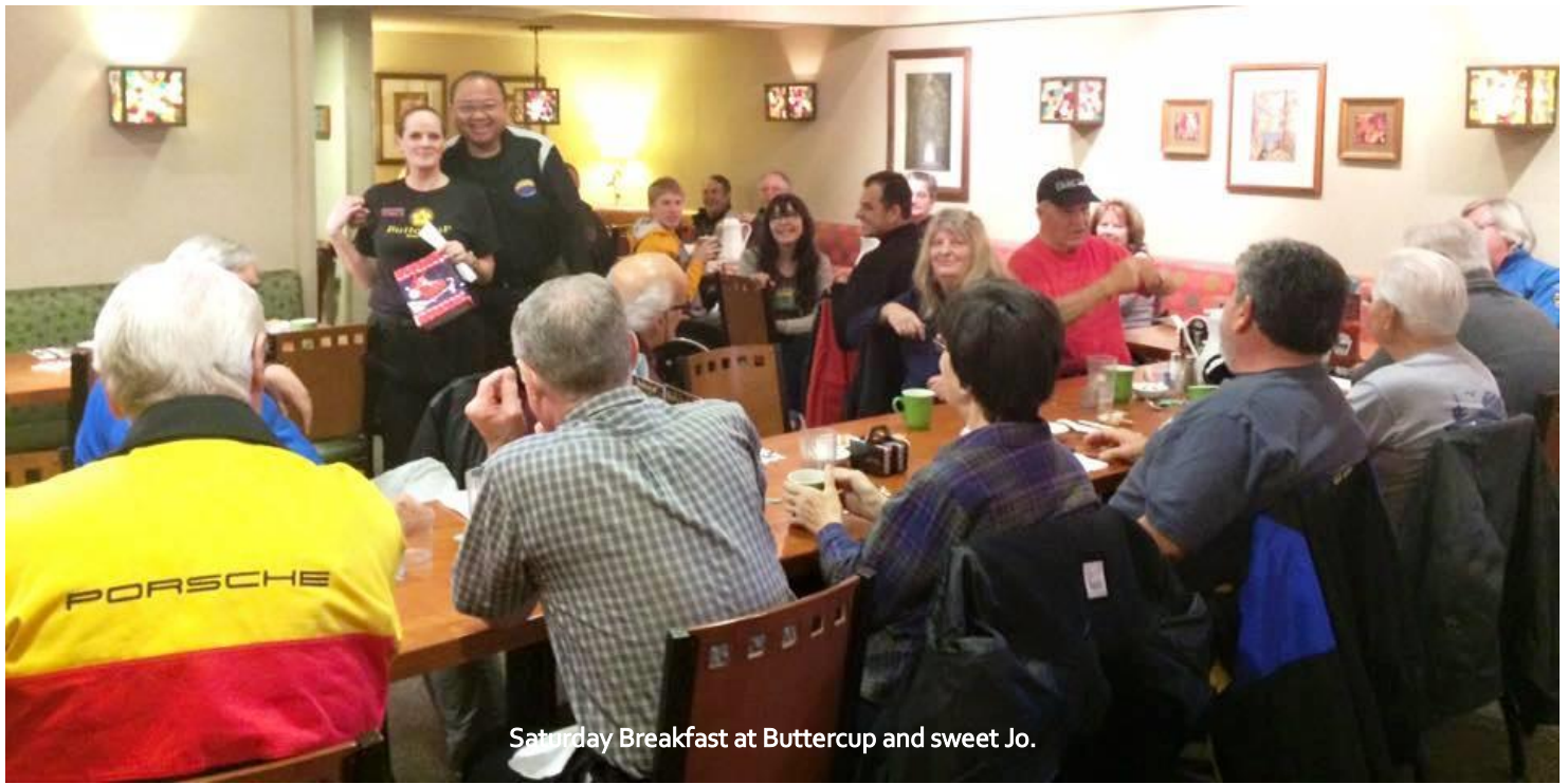
Saturday Breakfast at Buttercup and sweet Jo.