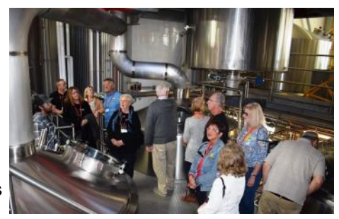
While many participants headed home, several joined other Diablo Region members in Monterey for a very successful and well attended DE event at Laguna Seca.