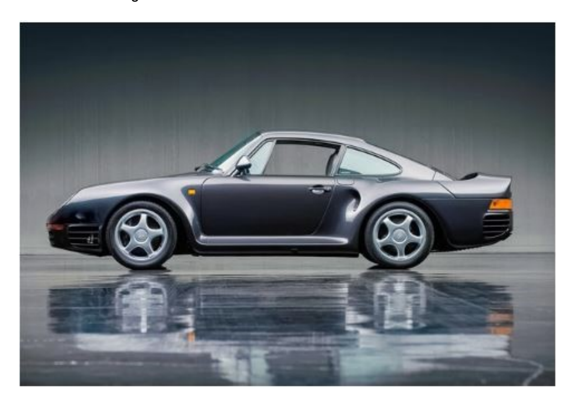
The 959 was the most technologically advanced supercar of its generation.

For Porsche, it makes sense it's actually integral to the coat of arms for the city of Stuttgart, Porsche's home. Ferrari only uses it because an Italian fighter ace shot down a pilot over Stuttgart in WWI, and the ace's mother told Ferrari to use the horse as good luck. From Thrillist