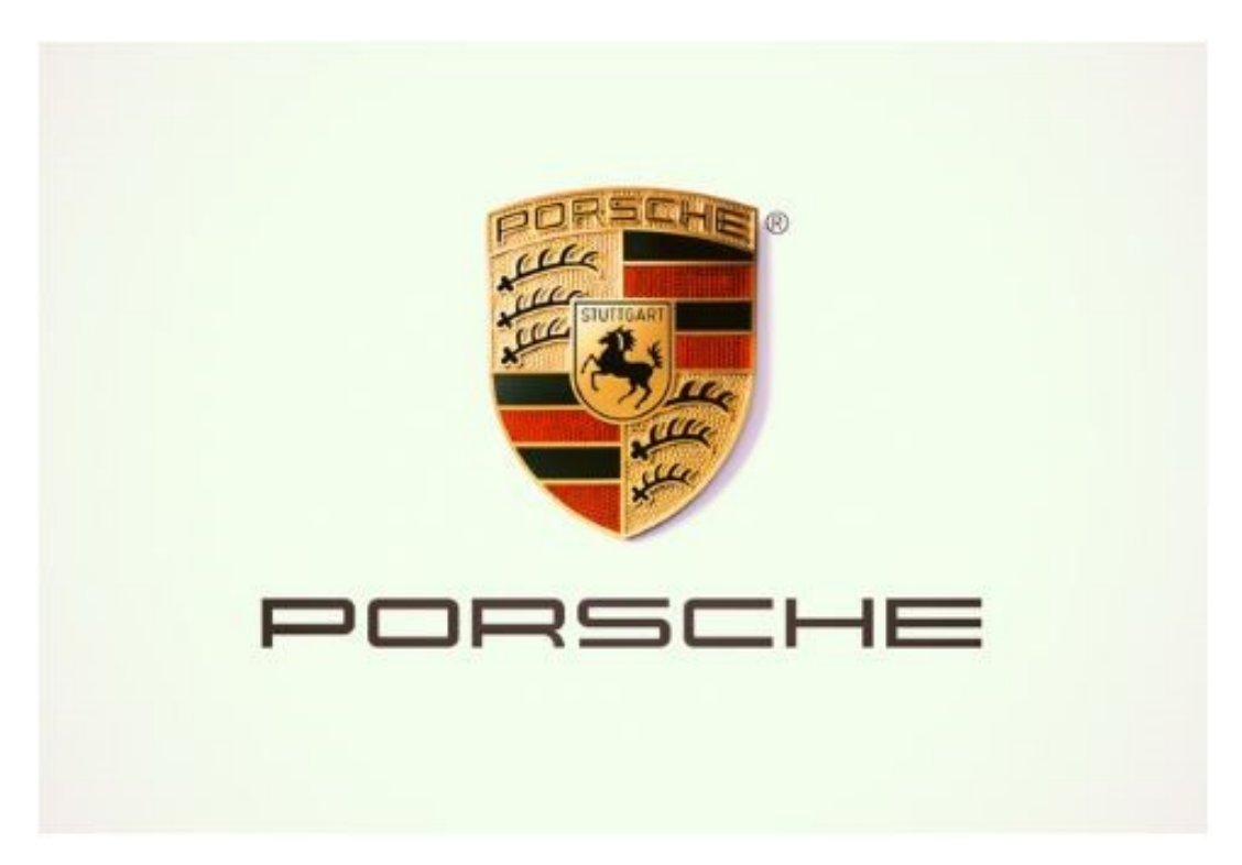
The prancing horse on the Porsche Crest is similar to the horse on the Ferrari Crest.

For Porsche, it makes sense it's actually integral to the coat of arms for the city of Stuttgart, Porsche's home. Ferrari only uses it because an Italian fighter ace shot down a pilot over Stuttgart in WWI, and the ace's mother told Ferrari to use the horse as good luck. From Thrillist