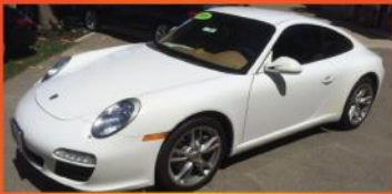
2009 PORSCHE 911 CARRERA 45k, NAVI, PDK, PASM, Navi, Bose 1 Owner - Carfax VIN # WPS706796 $49,485