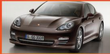
2013 PORSCHE PANAMERA Low Miles, Manufacturers Warranty 1 Owner - Carfax VIN # DL0134524 $65,585