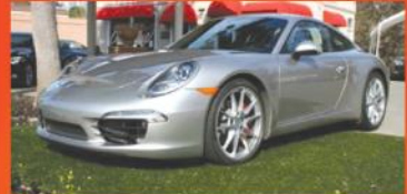
2012 PORSCHE 991 SPE 24k, Bose, NAV, DVD, Rear Spoiler 1 Owner - Carfax VIN # CS121810 $76,000