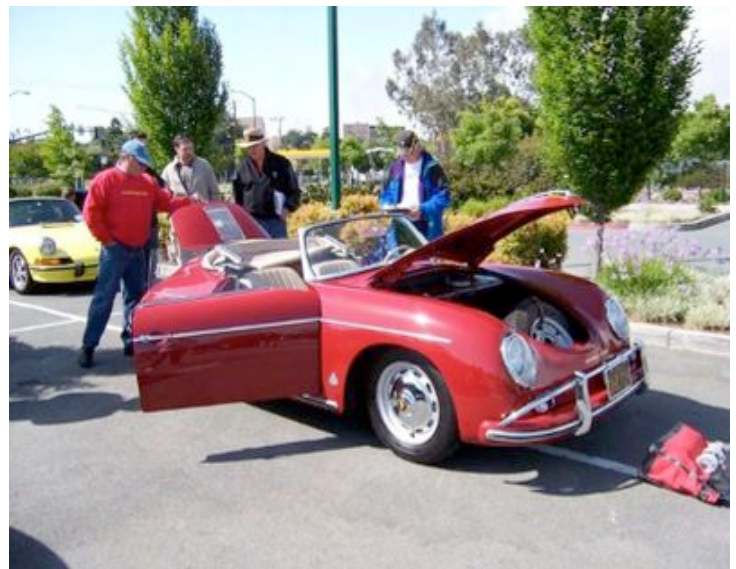
Beautiful 356- received the most awards that day.

Diablo Region PCA held it's 22nd Annual Wash N Shine on Sunday, May 27th at Heather Farms Park in Walnut Creek. Many spectators, included some of our new members , decided to join in the judging along with having their cars judged as well. We were pleased to see our new members going home with awards! The event was sponsored by Porsche of Fremont.