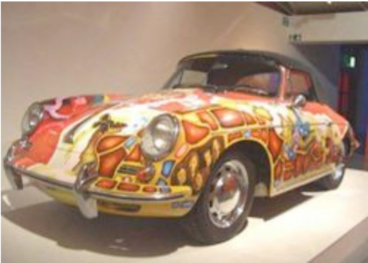
Janis Joplin's 1965 356 Porsche, which she paid $3500 in 1968

This psychedelic Porsche was once owned and driven by the legendary Janis Joplin who, ironically, is well known for the song "Mercedes Benz," the lyrics to which include the line "Oh Lord, won't you buy me/a Mercedes-Benz/My friends all drive Porsches/I must make amends." The car was used by Joplin who later commissioned a former Big Brother and The Holding Company roadie to paint it with a design that is now part of her legend. He charged her $500. The year 1965 was the last for the Porsche 356 which was replaced with the 911. So highly regarded is the 356 that more than half of the 78,000 units produced between 1949 (the model's first year) and 1965 are believed to still exist.